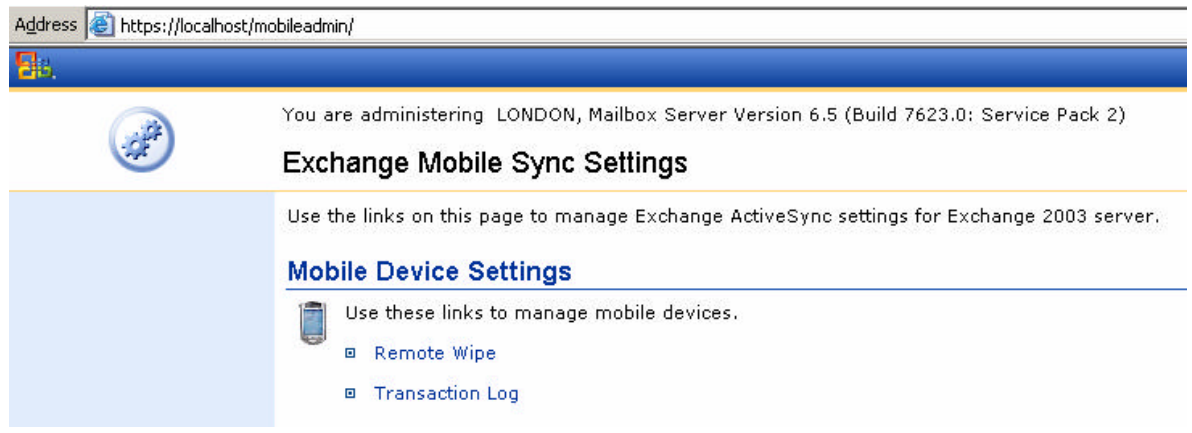
Figure 5: Exchange Active Sync tool

After installing the Microsoft Exchange Server Active Sync Web Administration Tool you can start your favourite web browser and navigate to https://servername/mobileadmin to remotely wipe a mobile device or to display the transaction log.