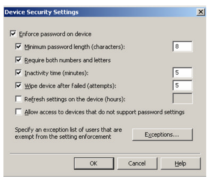
Figure 2: Enhanced Mobile features

It is also possible to centrally enforce settings like password policies and password complexity and timeouts.