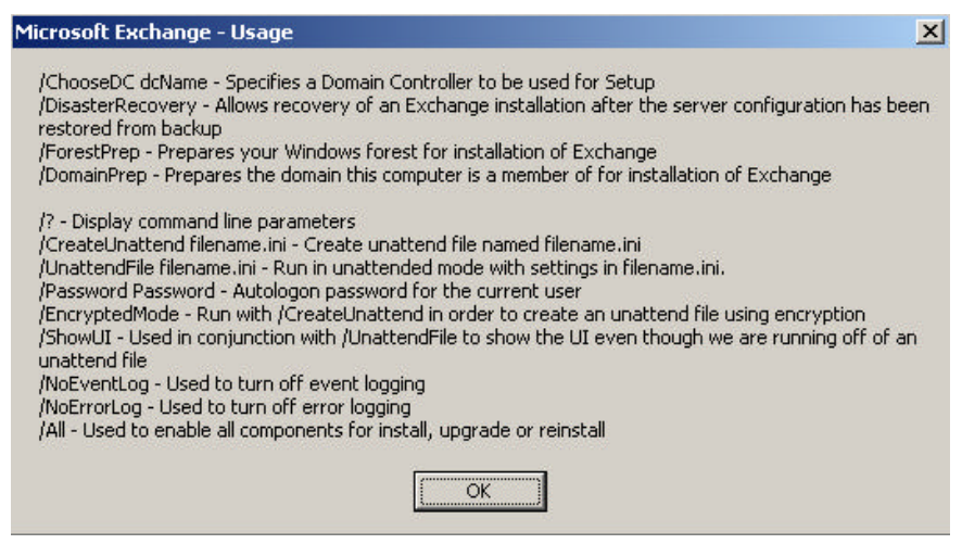
Figure 4: Exchange Server 2003 Setup switches

For more information about possible Exchange Server 2003 Setup <u>switches</u>, type SETUP /? at the command prompt (Figure 4).