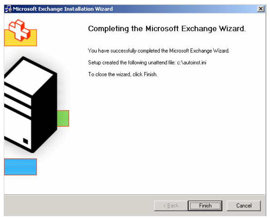
Figure 2: Setup created the unattend file c:\autoinst.ini